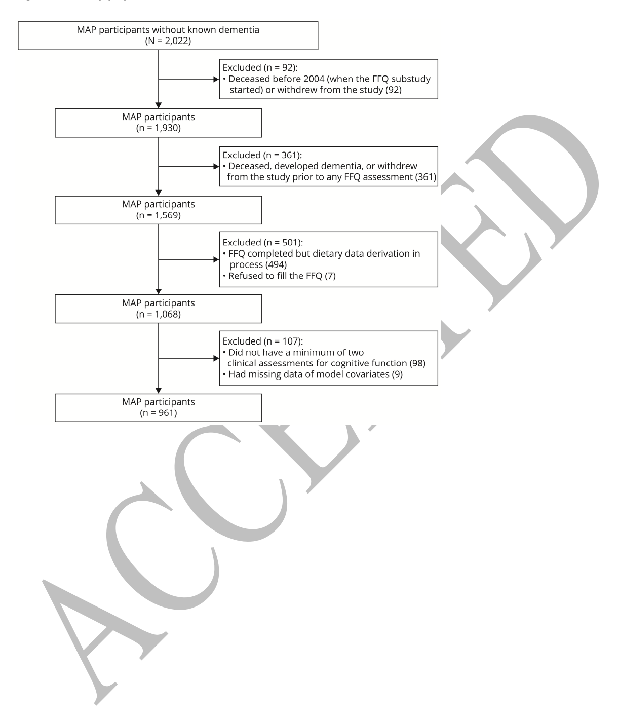
Figure 1: Study population flow chart