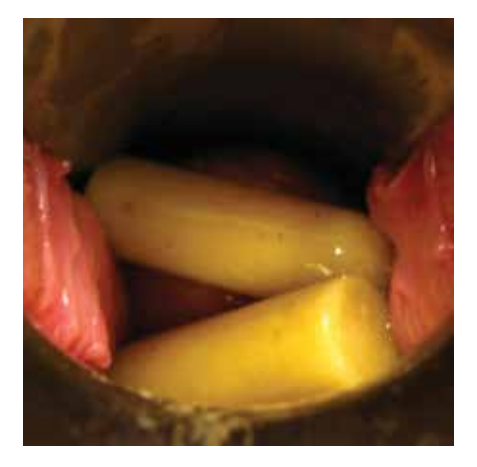
Step 4 Insert 2 Vag Pack<sup>d</sup> suppositories into the vagina, against the surface of the cervix.

<sup>a</sup>Bromelain contains proteolytic enzymes, which have antiedematous, anticoagulant, and antimetastatic properties. As part of the escharotic treatment, it is used to promote soft-tissue wound healing.<sup>14-16</sup>