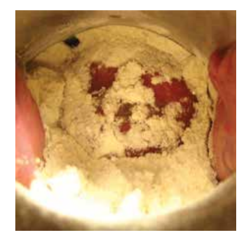
Step 1 Apply bromelian powder<sup>a</sup> to the cervix. Add light source and wait 15 min.

Figure 1. Escharotic Treatment Protocol (performed in office)<sup>41</sup>